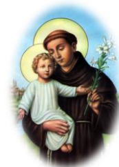
San Antonio de Padua – 13 de junio