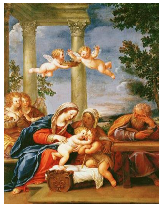
Natividad de San Juan Bautista – 24 de junio