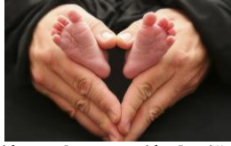
Día de oración por la protección de niños no nacidos 23 de enero 2017