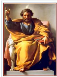
Fiesta de la Cátedra de San Pedro, Apóstol - 22 de febrero de 2017

El lunes, 20 de febrero de 2017, es el Día de los Presidentes. Habrá sólo una Misa a las 9:00 a.m. y la Rectoría estará cerrada.