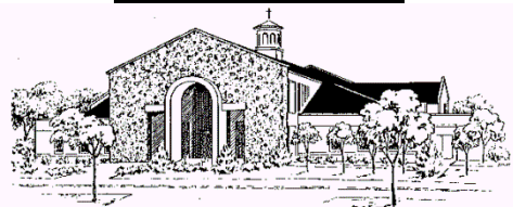
Mass attendance May 5/6: 1649