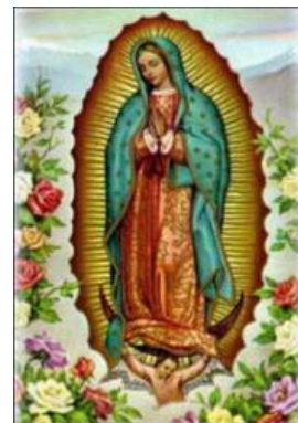
Nuestra Señora de Guadalupe 12 de diciembre